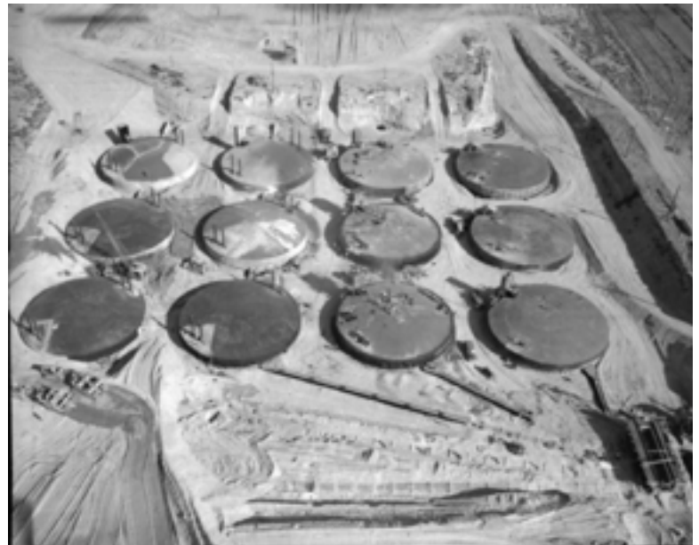
Historic photo of Hanford’s Tank Farm.

Columbia Riverkeeper’s mission is to protect and restore the water quality of the Columbia River and all life connected to it, from the headwaters to the Pacific Ocean.